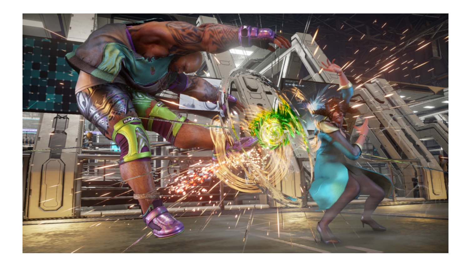
TEKKEN 7 - DLC8: Julia Chang Download With Crack

Download ->>> <a href="http://bit.ly/2JXGDWs">http://bit.ly/2JXGDWs</a>