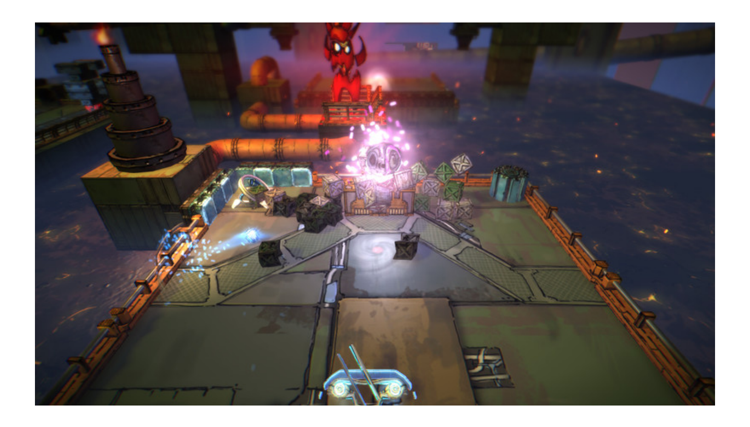
Download ->>> http://bit.lv/2JmJEiX